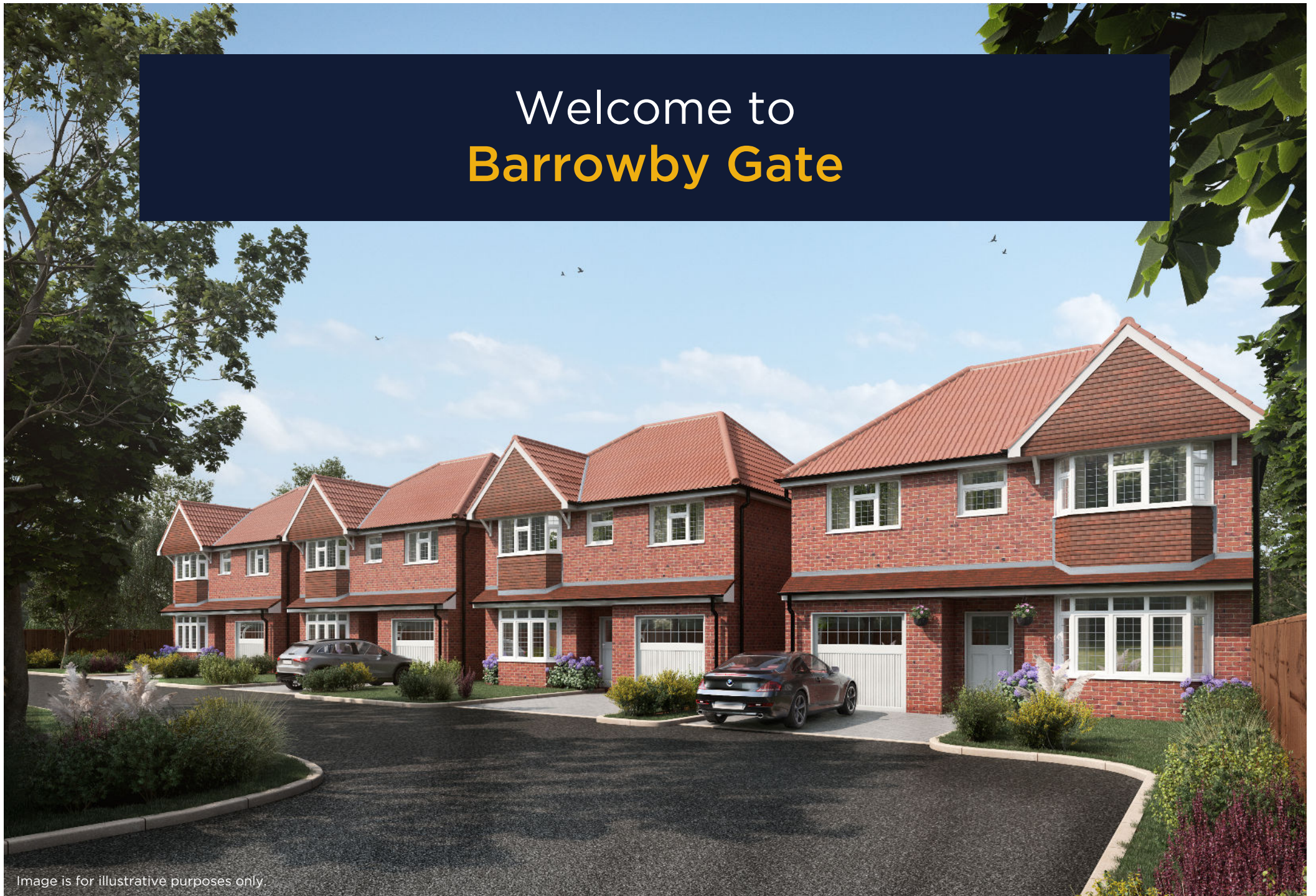
Image is for illustrative purposes only.