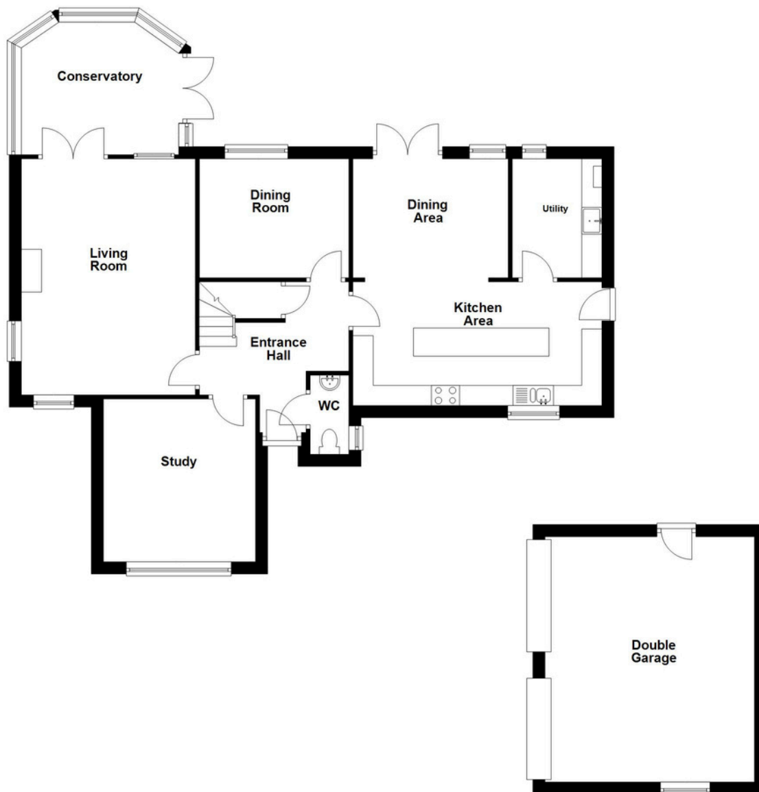
Ground Floor Approx. 147.4 sq. metres (1586.8 sq. feet)